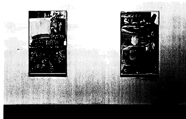
Installation of Robert Rauschenberg: The Silk-screen Paintings 1962-64 , Whitney Museum of American Art, December 7, 1990-March 17, 1991.