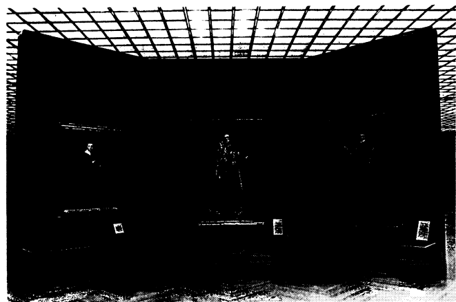
Photography in the Museum

Installation of paintings by Eduoard Manet in the André Meyer Galleries, Metropolitan Museum of Art, 1982 (photo Louise Lawler).