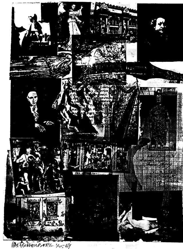
Robert Rauschenberg, Centennial Certificate , Metropolitan Museum of Art , 1969 (The Met- ropolitan Museum of Art, Florence and Joseph Singer Collection, 1969).

This certificate, containing photographic reproductions of masterpieces of art—without the intrusion of anything else—was signed by the Metropolitan Museum officials.