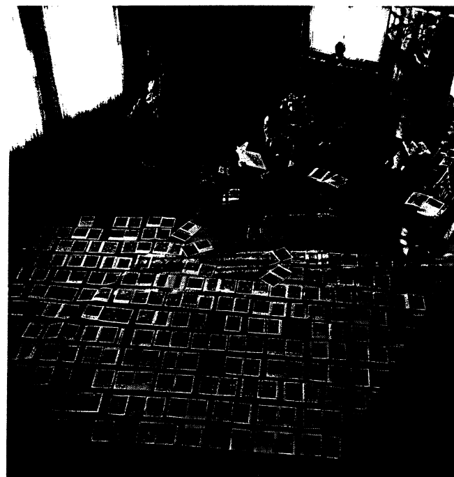
André Malraux with the photographic plates for The Museum without Walls.

Malraux was enraptured by the endless possibilities of his Museum, by the proliferation of discourses it could set in motion, establishing ever new stylistic series simply by reshuffling the photographs. That proliferation is enacted by Rauschenberg: Malraux's dream has become Rauschenberg's joke. But, of course, not everyone gets the joke, least of all Rauschenberg himself, judging from the proclamation he composed for the Metropolitan Museum's Centennial Certificate in 1970: